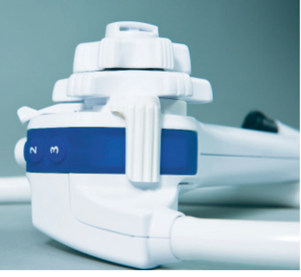
Elevator control lever to raise (up) and lower (down) the elevator