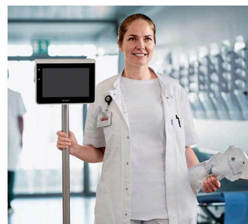
Ambu® aView™ on IV pole - small footprint and easily moved