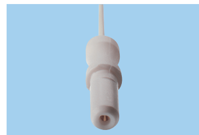
K = 1.5 mm connector