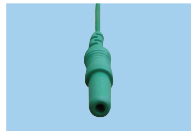
M = 1.5 mm connector